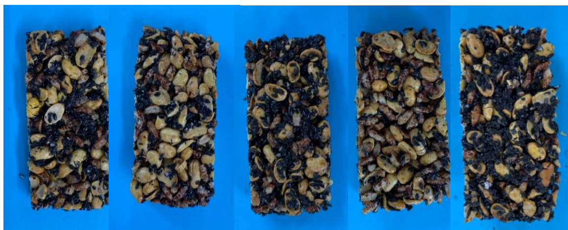
Figure 2. Illustrates the nutrient bars with blending ratios according to formulas FM1, FM2, FM3, FM4, and FM5 (from left to right).